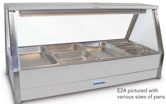
E24 pictured with various sizes of pans