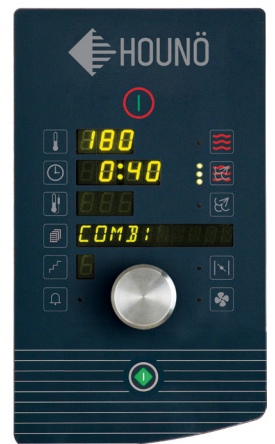
K standard model