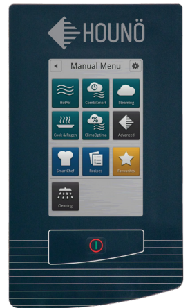
KPE touch model