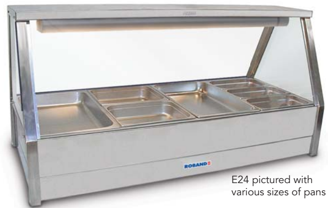
E24 pictured with various sizes of pans