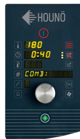
K standard model