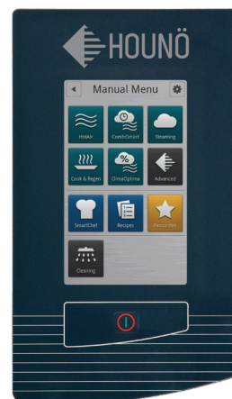
KPE touch model